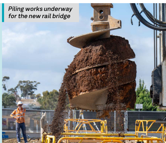
Piling works underway for the new rail bridge

Scan the QR code to check out our construction progress in our online image galleries or visit: levelcrossings.vic.gov.au/melton