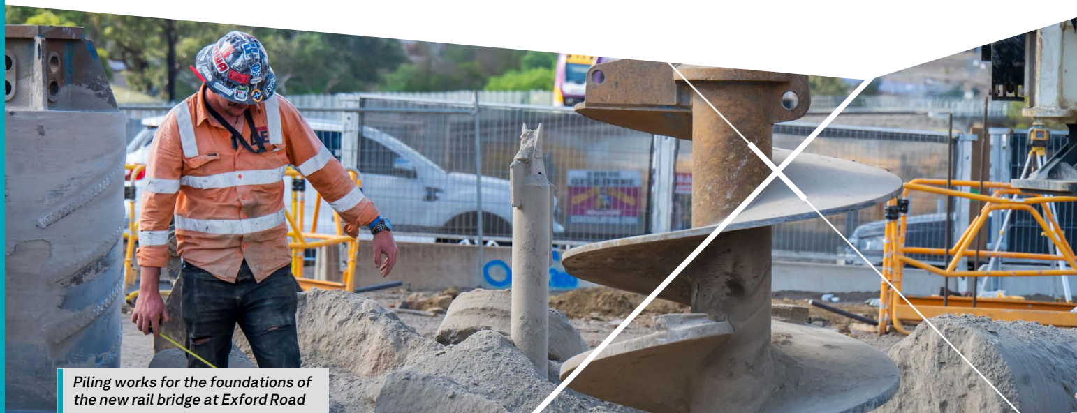
Piling works for the foundations of the new rail bridge at Exford Road